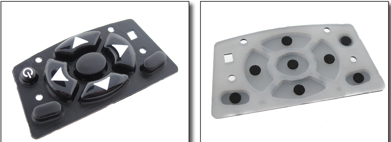
Figure 2. Conductive rubber keypads with a semi-conductive pill or puck.

Conductive rubber keypads contain a semi-conductive pill or puck that is pre-molded with a mixture of carbon particles and silicone rubber (Figure 2). The mixture contains enough carbon particles so that the surface is somewhat conductive but with enough silicone rubber to hold the carbon particles together. The pill or puck is permanently attached to the bottom of the keytop at each switch location during the final molding operation. The pills are placed in the mold in a similar fashion to insert molding used for molding terminals in electrical connectors.