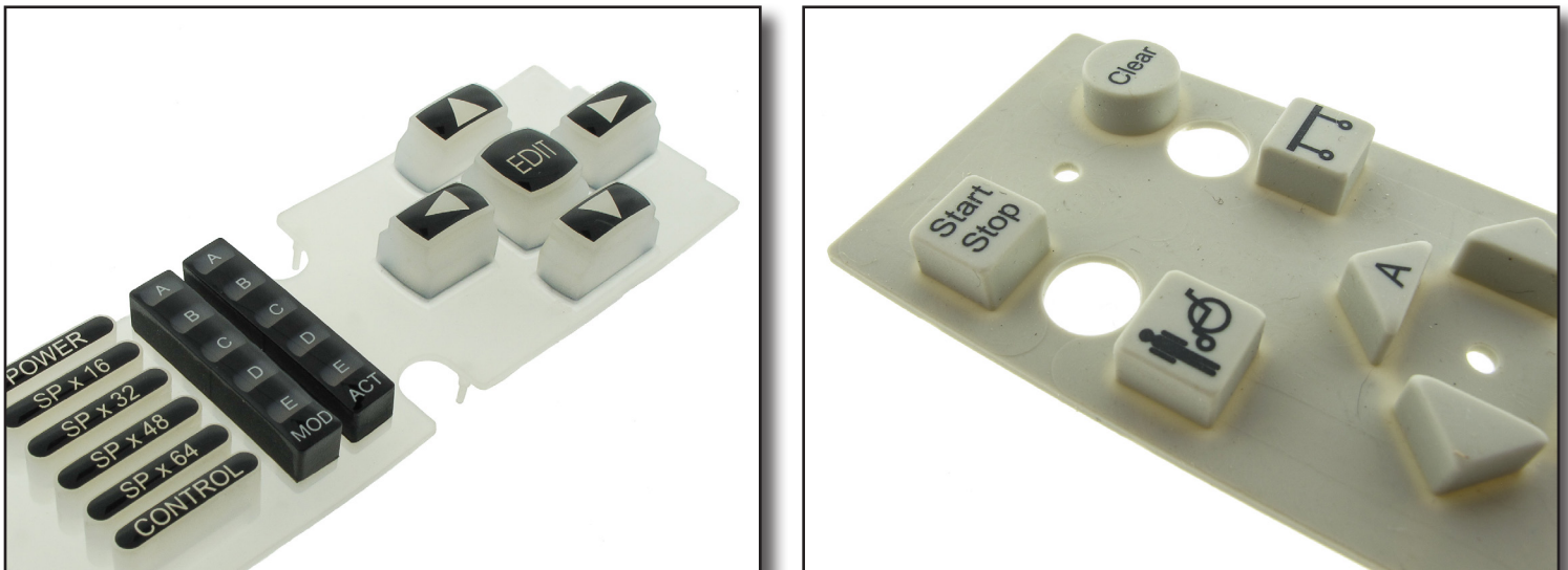
Figure 1. Molded silicone rubber keypads.

Rubber keypads are a single piece of high-grade molded silicone rubber incorporating visible keytops into a base mat that rests against a printed circuit board and a thin web of rubber between the keytops and base mat (Figure 1).